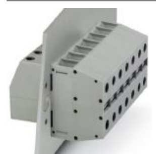
The figure shows a 7-position version

Please be informed that the data shown in this PDF Document is generated from our Online Catalog. Please find the complete data in the user's documentation. Our General Terms of Use for Downloads are valid (http://phoenixcontact.com/download)