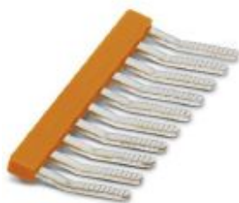
Insertion bridge, 10-pos., divisible, fully insulated

Please be informed that the data shown in this PDF Document is generated from our Online Catalog. Please find the complete data in the user's documentation. Our General Terms of Use for Downloads are valid ( http://phoenixcontact.com/download )