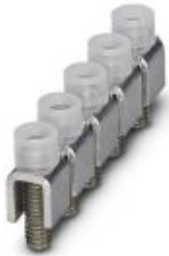
Fixed bridge, pitch: 15 mm, number of positions: 5, color: silver

Please be informed that the data shown in this PDF Document is generated from our Online Catalog. Please find the complete data in the user's documentation. Our General Terms of Use for Downloads are valid ( http://phoenixcontact.com/download )