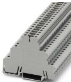
Sensor/actuator terminal block, with integrated diode, connection method: Screw connection, cross section: 0.2 mm 2 - 4 mm 2 , AWG: 24 - 12, width: 6.2 mm, color: gray, mounting type: NS 35/7,5, NS 35/15

Please be informed that the data shown in this PDF Document is generated from our Online Catalog. Please find the complete data in the user's documentation. Our General Terms of Use for Downloads are valid ( http://phoenixcontact.com/download )