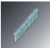
Fixed bridge, number of positions: 16, color: silver