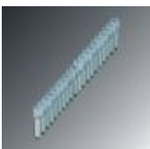
Fixed bridge, pitch: 5 mm, number of positions: 20, color: silver