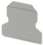
Partition plate, length: 56 mm, width: 1.5 mm, height: 45.7 mm, color: gray