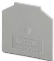
End cover, length: 43.5 mm, width: 1.5 mm, height: 40.8 mm, color: gray

Please be informed that the data shown in this PDF Document is generated from our Online Catalog. Please find the complete data in the user's documentation. Our General Terms of Use for Downloads are valid ( http://phoenixcontact.com/download )