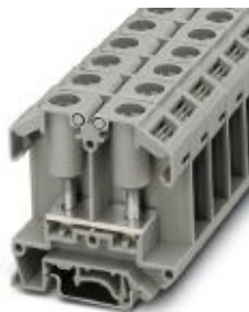
Universal terminal block with bolt connection, cross section: 0.1 - 25 mm 2 , width: 18 mm, color: gray

Please be informed that the data shown in this PDF Document is generated from our Online Catalog. Please find the complete data in the user's documentation. Our General Terms of Use for Downloads are valid ( http://phoenixcontact.com/download )