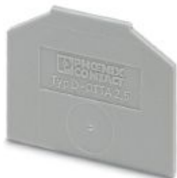
End cover, length: 43.5 mm, width: 1.5 mm, height: 34.3 mm, color: gray

Please be informed that the data shown in this PDF Document is generated from our Online Catalog. Please find the complete data in the user's documentation. Our General Terms of Use for Downloads are valid ( http://phoenixcontact.com/download )