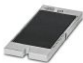
Magazine for the THERMOMARK CARD printer, for accommodating UCT sheets (UCT-WMT...)

Magazine - THERMOMARK CARD-UCT-MAG7 - 0801734