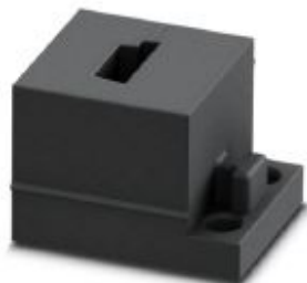
Small, slotted cable sleeves suitable for one AS-i cable (R), material: NBR, version: right

Please be informed that the data shown in this PDF Document is generated from our Online Catalog. Please find the complete data in the user's documentation. Our General Terms of Use for Downloads are valid ( http://phoenixcontact.com/download )