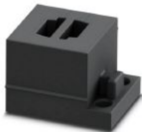
Small, slotted cable sleeves suitable for two AS-i cables (R-R), material: NBR, version: right, right

Please be informed that the data shown in this PDF Document is generated from our Online Catalog. Please find the complete data in the user's documentation. Our General Terms of Use for Downloads are valid ( http://phoenixcontact.com/download )