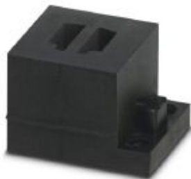
Small, slotted cable sleeves suitable for two AS-i cables (L-R), material: NBR, version: left, right

Please be informed that the data shown in this PDF Document is generated from our Online Catalog. Please find the complete data in the user's documentation. Our General Terms of Use for Downloads are valid ( http://phoenixcontact.com/download )