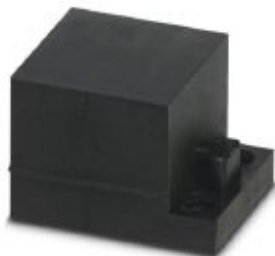
Small blind sleeve, material: NBR

Please be informed that the data shown in this PDF Document is generated from our Online Catalog. Please find the complete data in the user's documentation. Our General Terms of Use for Downloads are valid ( http://phoenixcontact.com/download )