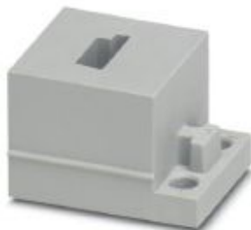
Small, slotted cable sleeves suitable for one AS-i cable (R), material: SEBS, version: right

Please be informed that the data shown in this PDF Document is generated from our Online Catalog. Please find the complete data in the user's documentation. Our General Terms of Use for Downloads are valid ( http://phoenixcontact.com/download )