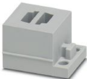
Small, slotted cable sleeves suitable for two AS-i cables (R-R), material: SEBS, version: right, right

Please be informed that the data shown in this PDF Document is generated from our Online Catalog. Please find the complete data in the user's documentation. Our General Terms of Use for Downloads are valid ( http://phoenixcontact.com/download )