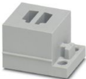
Small, slotted cable sleeves suitable for two AS-i cables (L-R), material: SEBS, version: left, right

Please be informed that the data shown in this PDF Document is generated from our Online Catalog. Please find the complete data in the user's documentation. Our General Terms of Use for Downloads are valid ( http://phoenixcontact.com/download )