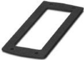
Flat gasket made of NBR, size B16

Please be informed that the data shown in this PDF Document is generated from our Online Catalog. Please find the complete data in the user's documentation. Our General Terms of Use for Downloads are valid ( http://phoenixcontact.com/download )