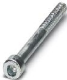
M4 replacement screw with 4 mm Allen screw head for sealing frame with screw locking

Please be informed that the data shown in this PDF Document is generated from our Online Catalog. Please find the complete data in the user's documentation. Our General Terms of Use for Downloads are valid ( http://phoenixcontact.com/download )