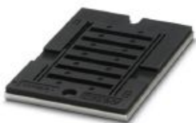
The figure shows version

Magazine, for the THERMOMARK PRIME and the THERMOMARK CARD, for accommodating UCT-TM..., UCT1(U)-TM..., UCT5-TM..., UCT-EM (5x10), UCT-EM (6x10)