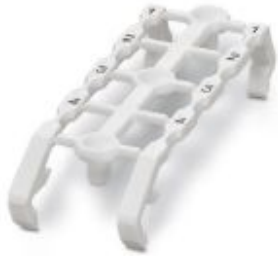
Marker for terminal blocks, white, labeled, mounting type: snapped, for terminal block width: 4 mm, lettering field size: 2,4x 9,2 mm

Please be informed that the data shown in this PDF Document is generated from our Online Catalog. Please find the complete data in the user's documentation. Our General Terms of Use for Downloads are valid ( http://phoenixcontact.com/download )