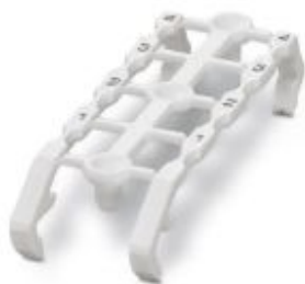
Marker for terminal blocks, white, labeled, mounting type: snapped, for terminal block width: 4 mm, lettering field size: 2,4x 9,2 mm

Please be informed that the data shown in this PDF Document is generated from our Online Catalog. Please find the complete data in the user's documentation. Our General Terms of Use for Downloads are valid ( http://phoenixcontact.com/download )