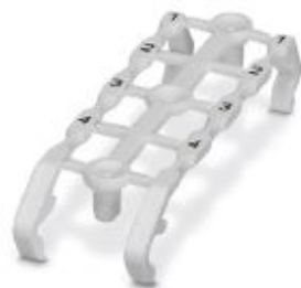
Marker for terminal blocks, white, labeled, mounting type: snapped, for terminal block width: 4 mm, lettering field size: 2,4x 9,2 mm

Please be informed that the data shown in this PDF Document is generated from our Online Catalog. Please find the complete data in the user's documentation. Our General Terms of Use for Downloads are valid ( http://phoenixcontact.com/download )