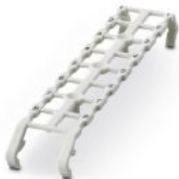
Marker for terminal blocks, white, labeled, mounting type: snapped, for terminal block width: 8 mm, lettering field size: 2,4x 9,2 mm, Number of individual labels: 2

Please be informed that the data shown in this PDF Document is generated from our Online Catalog. Please find the complete data in the user's documentation. Our General Terms of Use for Downloads are valid ( http://phoenixcontact.com/download )