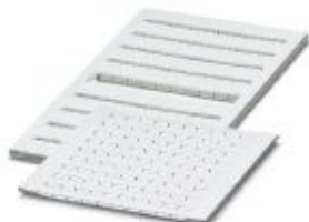
Zack marker sheet flat, 120-section, horizontally labeled with the consecutive numbers: 1 ... 12, suitable for all terminal blocks with 5.2 mm pitch, white

Please be informed that the data shown in this PDF Document is generated from our Online Catalog. Please find the complete data in the user's documentation. Our General Terms of Use for Downloads are valid ( http://phoenixcontact.com/download )