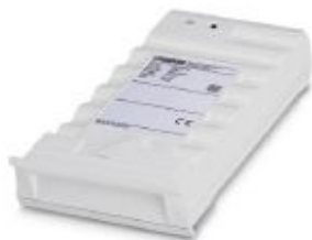
Replacement battery for the THERMOMARK PRIME, NiMH 18 V DC, 2.1 Ah

Please be informed that the data shown in this PDF Document is generated from our Online Catalog. Please find the complete data in the user's documentation. Our General Terms of Use for Downloads are valid ( http://phoenixcontact.com/download )