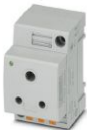
Socket, Type: D, Push-in spring connection, for India/Africa and other countries, with LED display, gray, for mounting on a DIN rail in the service interface or direct mounting, 250 V AC, 6 A, -20 °C, 60 °C, IS 1293

Please be informed that the data shown in this PDF Document is generated from our Online Catalog. Please find the complete data in the user's documentation. Our General Terms of Use for Downloads are valid ( http://phoenixcontact.com/download )