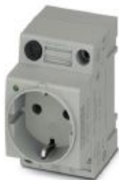
Socket, Pin connector pattern type CF, Screw connection, LED display and fuse 5 x 20 mm, 6.3 A, gray, for mounting on a DIN rail in the service interface or direct mounting, 250 V AC, 16 A, -20 °C, 60 °C, VDE 0620-1

Please be informed that the data shown in this PDF Document is generated from our Online Catalog. Please find the complete data in the user's documentation. Our General Terms of Use for Downloads are valid ( http://phoenixcontact.com/download )