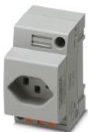
Socket, Pin connector pattern type J, Push-in spring connection, for Switzerland and other countries, gray, for mounting on a DIN rail in the service interface or direct mounting, 250 V AC, 16 A, -20 °C, 60 °C, SEV 1011

Please be informed that the data shown in this PDF Document is generated from our Online Catalog. Please find the complete data in the user's documentation. Our General Terms of Use for Downloads are valid ( http://phoenixcontact.com/download )