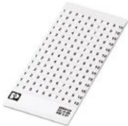
Marker card, self-adhesive, horizontally labeled with the consecutive numbers: 11 ... 20, 10-section marker strips with 14 identical decades, white

Please be informed that the data shown in this PDF Document is generated from our Online Catalog. Please find the complete data in the user's documentation. Our General Terms of Use for Downloads are valid ( http://phoenixcontact.com/download )