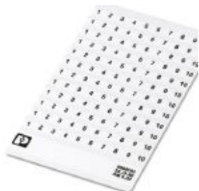
Marker card, self-adhesive, horizontally labeled with the consecutive numbers: 1 ... 10, 10-section marker strips with 12 identical decades, white

Please be informed that the data shown in this PDF Document is generated from our Online Catalog. Please find the complete data in the user's documentation. Our General Terms of Use for Downloads are valid ( http://phoenixcontact.com/download )