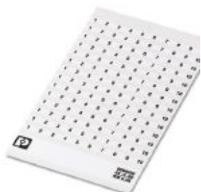
Marker card, self-adhesive, horizontally labeled with the consecutive numbers: 61 ... 70, 10-section marker strips with 14 identical decades, white

Please be informed that the data shown in this PDF Document is generated from our Online Catalog. Please find the complete data in the user's documentation. Our General Terms of Use for Downloads are valid ( http://phoenixcontact.com/download )