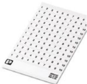
Marker card, self-adhesive, horizontally labeled with the consecutive numbers: 91 ... 100, 10-section marker strips with 12 identical decades, white

Please be informed that the data shown in this PDF Document is generated from our Online Catalog. Please find the complete data in the user's documentation. Our General Terms of Use for Downloads are valid ( http://phoenixcontact.com/download )