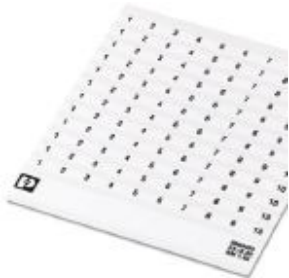
Marker card, self-adhesive, labeled with the consecutive numbers: 11 ... 20, 10-section marker strips with 10 identical decades, white

Please be informed that the data shown in this PDF Document is generated from our Online Catalog. Please find the complete data in the user's documentation. Our General Terms of Use for Downloads are valid ( http://phoenixcontact.com/download )