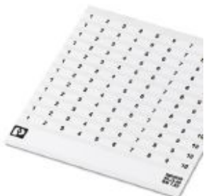
Marker card, self-adhesive, horizontally labeled with the consecutive numbers: 1 ... 10, 10-section marker strips with 12 identical decades, white

Please be informed that the data shown in this PDF Document is generated from our Online Catalog. Please find the complete data in the user's documentation. Our General Terms of Use for Downloads are valid ( http://phoenixcontact.com/download )