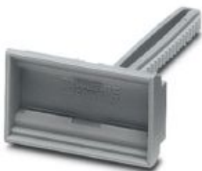
Terminal strip marker carrier, gray, unlabeled, mounting type: plug in, lettering field size: 20 mm x 8 mm

Please be informed that the data shown in this PDF Document is generated from our Online Catalog. Please find the complete data in the user's documentation. Our General Terms of Use for Downloads are valid ( http://phoenixcontact.com/download )