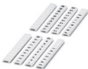
Zack marker strip flat, 10-section, horizontally labeled with the consecutive numbers: 301 ... 310, white

Please be informed that the data shown in this PDF Document is generated from our Online Catalog. Please find the complete data in the user's documentation. Our General Terms of Use for Downloads are valid ( http://phoenixcontact.com/download )