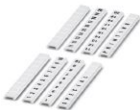
Zack marker strip flat, 10-section, horizontally labeled with the consecutive numbers: 351 ... 360, white

Please be informed that the data shown in this PDF Document is generated from our Online Catalog. Please find the complete data in the user's documentation. Our General Terms of Use for Downloads are valid ( http://phoenixcontact.com/download )