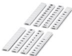
Zack marker strip flat, 10-section, horizontally labeled with the consecutive numbers: 431 ... 440, white

Please be informed that the data shown in this PDF Document is generated from our Online Catalog. Please find the complete data in the user's documentation. Our General Terms of Use for Downloads are valid ( http://phoenixcontact.com/download )