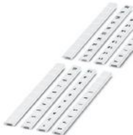
Zack marker strip flat, 10-section, horizontally labeled with the consecutive numbers: 1 ... 10, white, width: 8 mm

Please be informed that the data shown in this PDF Document is generated from our Online Catalog. Please find the complete data in the user's documentation. Our General Terms of Use for Downloads are valid ( http://phoenixcontact.com/download )