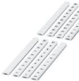
Zack marker strip flat, 10-section, horizontally labeled with the consecutive numbers: 11 ... 20, white, width: 8 mm

Please be informed that the data shown in this PDF Document is generated from our Online Catalog. Please find the complete data in the user's documentation. Our General Terms of Use for Downloads are valid ( http://phoenixcontact.com/download )