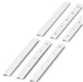
Zack marker strip, 10-section, horizontally labeled with the consecutive numbers: 81 ... 90, white

Please be informed that the data shown in this PDF Document is generated from our Online Catalog. Please find the complete data in the user's documentation. Our General Terms of Use for Downloads are valid ( http://phoenixcontact.com/download )