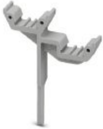
Marker carriers, gray, unlabeled, mounting type: plug in, lettering field size: 4 x 10.5 mm

Please be informed that the data shown in this PDF Document is generated from our Online Catalog. Please find the complete data in the user's documentation. Our General Terms of Use for Downloads are valid ( http://phoenixcontact.com/download )