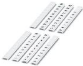
Zack marker strip flat, 10-section, horizontally labeled with the consecutive even numbers: 2 ... 20, white

Please be informed that the data shown in this PDF Document is generated from our Online Catalog. Please find the complete data in the user's documentation. Our General Terms of Use for Downloads are valid ( http://phoenixcontact.com/download )