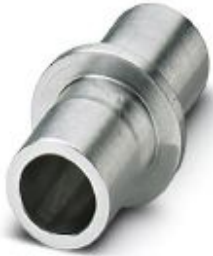
Aluminum adapter, to fix the P-PEN during plotter marking

Please be informed that the data shown in this PDF Document is generated from our Online Catalog. Please find the complete data in the user's documentation. Our General Terms of Use for Downloads are valid ( http://phoenixcontact.com/download )