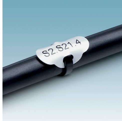
Figure may contain other products.