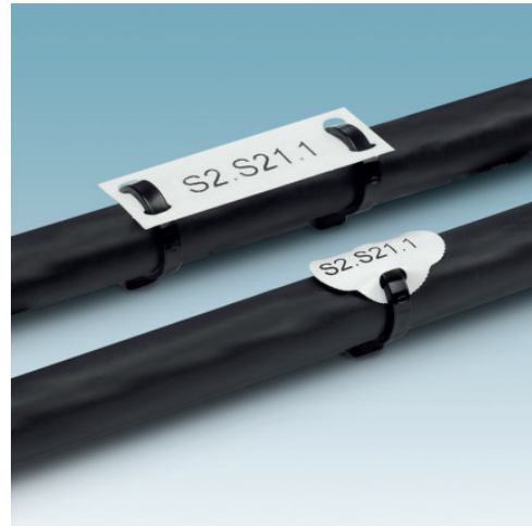
Figure may contain other products.