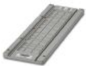
Magazine, for CMS-P1-PLOTTER, for accommodating UC-WMC 4.4...