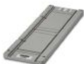
Magazine, for CMS-P1-PLOTTER and PLOTMARK, for accommodating UC-TMF..., UC1-TMF..., UC-WMT...

Phoenix Contact 2020 © - all rights reserved http://www.phoenixcontact.com