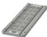
Magazine, for CMS-P1-PLOTTER, for accommodating UC-WMC 7,5...