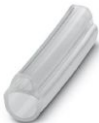
Conductor marker carrier, transparent, unlabeled, mounting type: slide-on, cable diameter range: 0.6 ... 1.2 mm, lettering field size: 18 x 4 mm

Please be informed that the data shown in this PDF Document is generated from our Online Catalog. Please find the complete data in the user's documentation. Our General Terms of Use for Downloads are valid ( http://phoenixcontact.com/download )