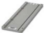
Magazine, for CMS-P1-PLOTTER and PLOTMARK, for accommodating UC-EMP..., UC-EMLP...